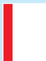
1/4 Page Vertical 255 x 42 mm