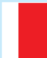
2/3 Page Vertical 255 x 119 mm