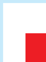
1/4 Page Vertical 125 x 88 mm