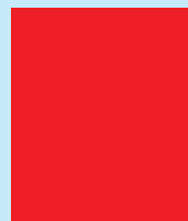
Full Page (Bleed) 305 x 215 mm