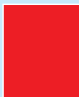
Full Page (Type Area) 255 x 181 mm