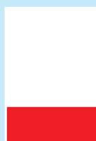
1/4 Page Horizontal 60 x 181 mm