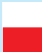
1/2 Page Horizontal 125 x 181 mm