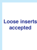
Loose inserts accepted Max. Size 255 x 180 mm Max. weight 200 gsm