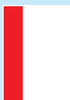
1/3 Page Vertical 255 x 57 mm